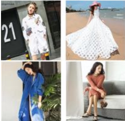
High Quality Fashion at Best Prices