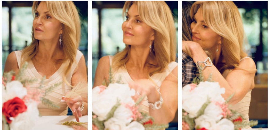
"Love Me Two Times"

First and foremost I'm an actress. I never really planned on any of the other stuff, but I also fell into the worlds of modelling and voice over, with over 20 years of experience, having the unique and wonderful opportunity to live and work in different countries.